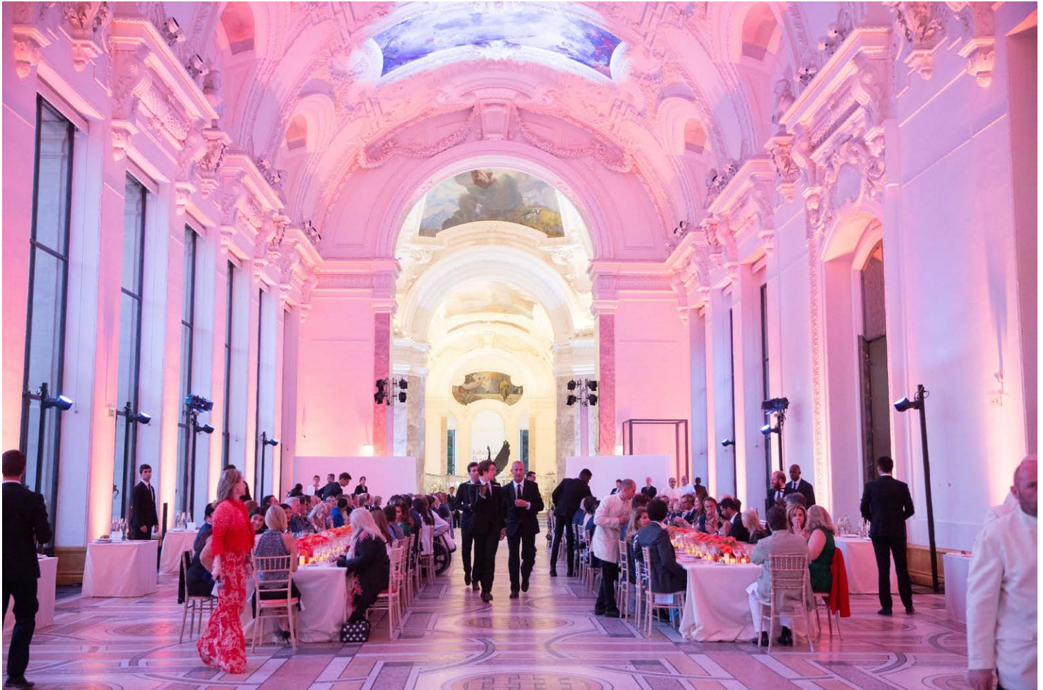
Liason Louvre. Petit Palais. 06/2017