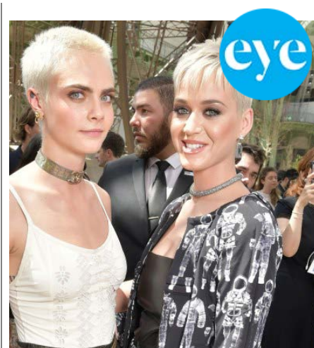
Front Row at Paris Fashion Week Haute Couture Fall 2017: All The Pictures