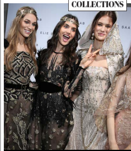
Backstage at Elie Saab Couture Fall 2017